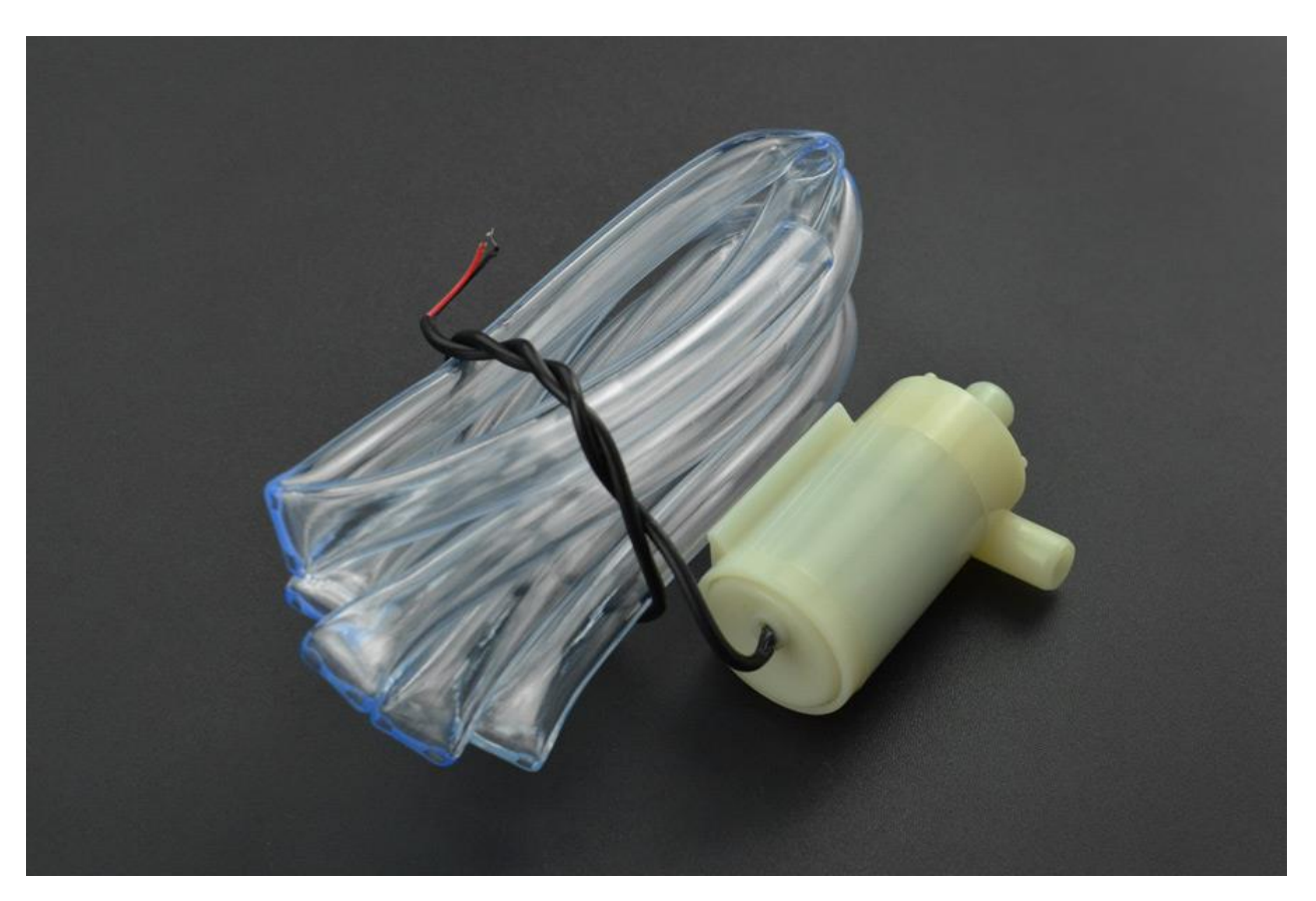
FIT0800 Amphibious Horizontal Submersible Pump