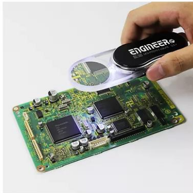
Slide out the lens to turn on the light automatically.