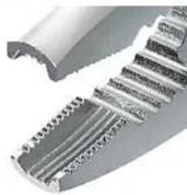
Horizontal and vertical serrations