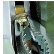
Slender jaws for work in confined areas