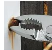
Remove problematic screws in seconds!