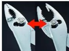
Slip-joint function for more possibilities