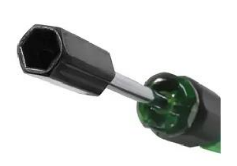
Hexagonal external design of the socket, works well in a confined area.