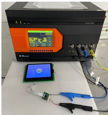
3.2 群脉冲测试图 EFT test