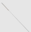
Needle for nozzle