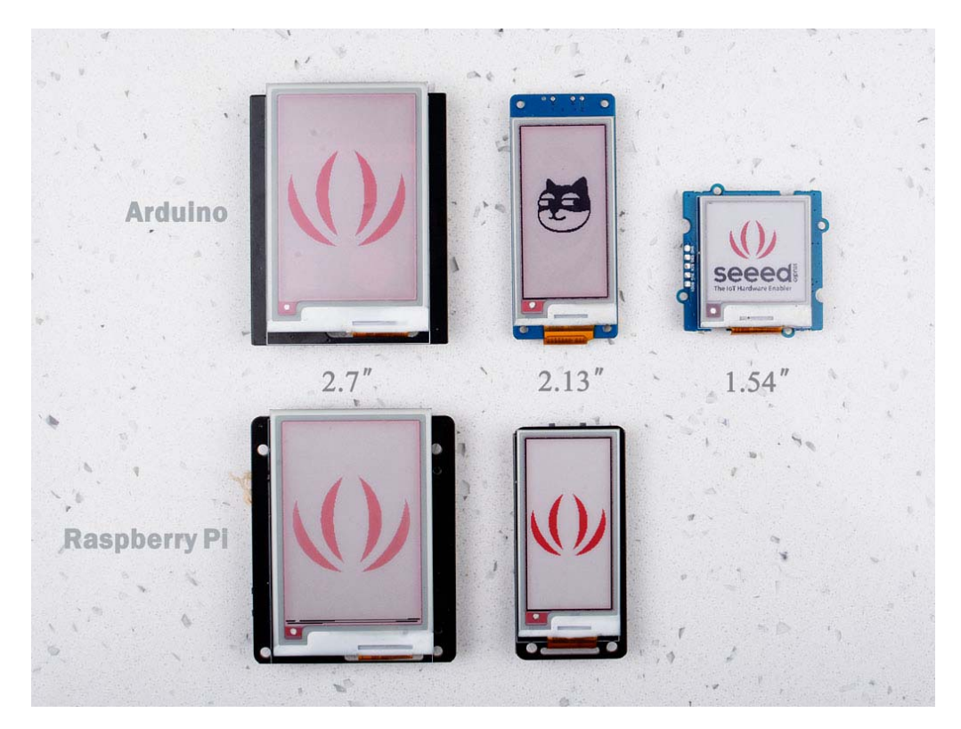
Figure 1. Seeed E-Ink Series

If you are interested, you can click on the image below to view the different sizes of Arduino E-Ink or Raspberry Pi E-Ink.