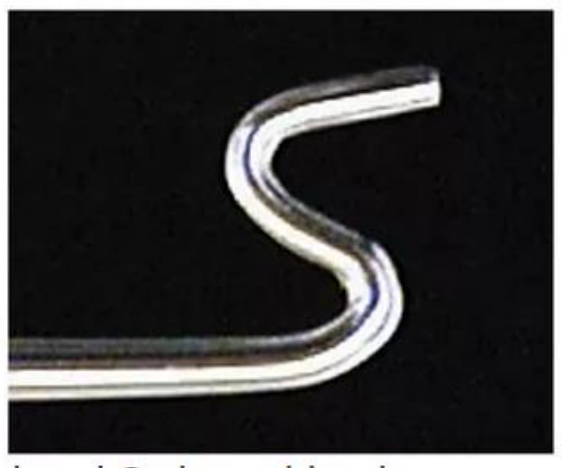
SS-21: U-shaped head and S-shaped hook