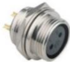
：反装双切面板前安装母座（镀镍-镀黑-镀金） : Installation from front of panel anti-loaded double section socket ( Nickel plated-black chrome plated- gold plated )