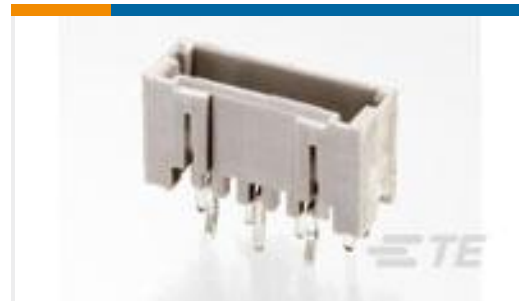
TE Part #292207-2 MINI CT SGL DIP V 2P NAT