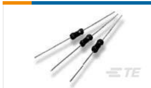
TE Part #3-1879352-1 RR02 5% 5R6 AMMO