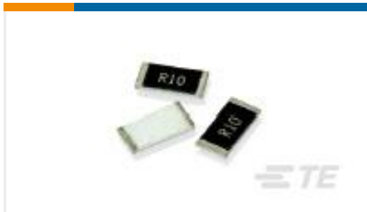
TE Part #3-2176055-8 RLP73K 2B R36 1% 1K RL