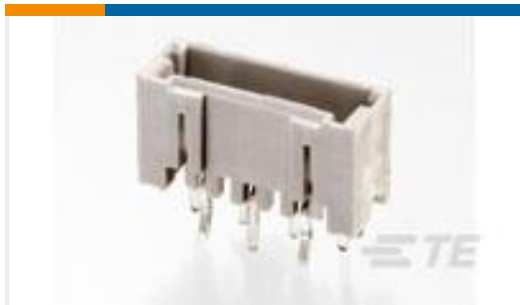
TE Part #292207-5 MINI CT SGL DIP V 5P NAT