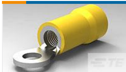
TE Part #34852 TERMINAL,PG R 12-10 6