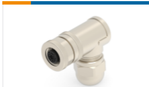
TE Part #T4112012081-000 M12 F, 8P GOLD A_CODE RA SHIELDED PG9