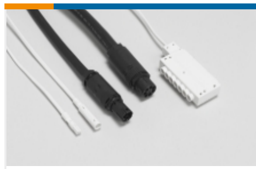
Lighting Cable Assemblies(2)