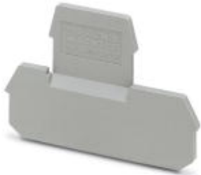
End cover, length: 62 mm, width: 5 mm, height: 40 mm, color: gray

Please be informed that the data shown in this PDF Document is generated from our Online Catalog. Please find the complete data in the user's documentation. Our General Terms of Use for Downloads are valid ( http://phoenixcontact.com/download )