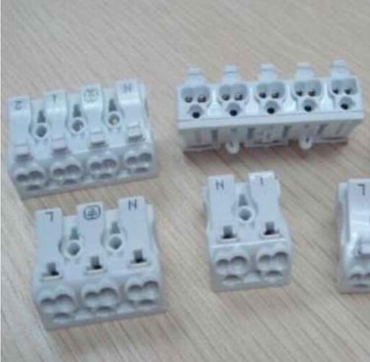
Spring Terminal Block