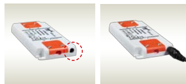
NEW direct plug-in feature!