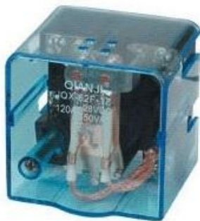
JQX-62F 1Z 120A