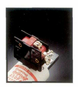
AOS-S Mounted on fuse