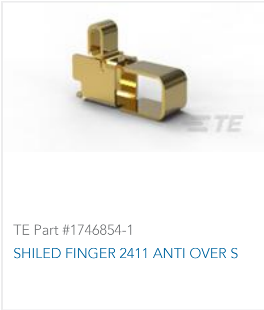
TE Part #1746854-1 SHILED FINGER 2411 ANTI OVER S