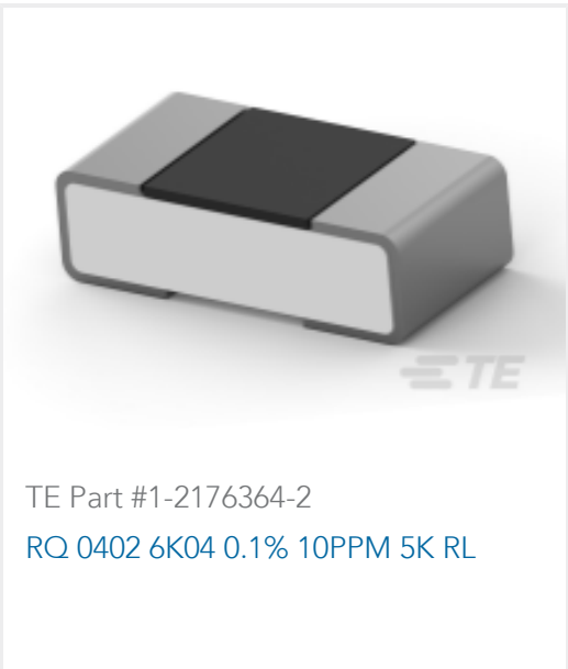
TE Part #1-2176364-2 RQ 0402 6K04 0.1% 10PPM 5K RL