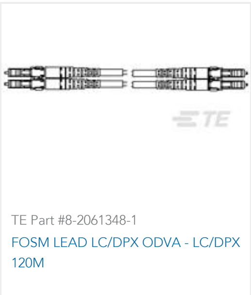
TE Part #8-2061348-1 FOSM LEAD LC/DPX ODVA - LC/DPX 120M