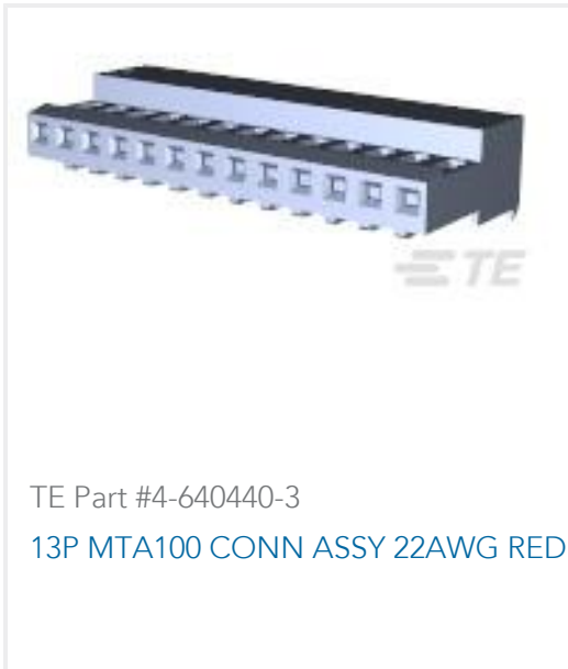
TE Part #4-640440-3 13P MTA100 CONN ASSY 22AWG RED