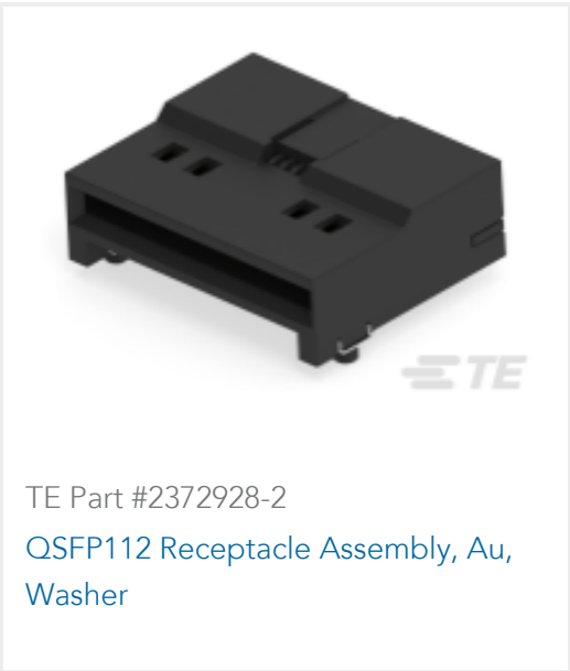
TE Part #2372928-2 QSPF112 Receptacle Assembly, Au, Washer