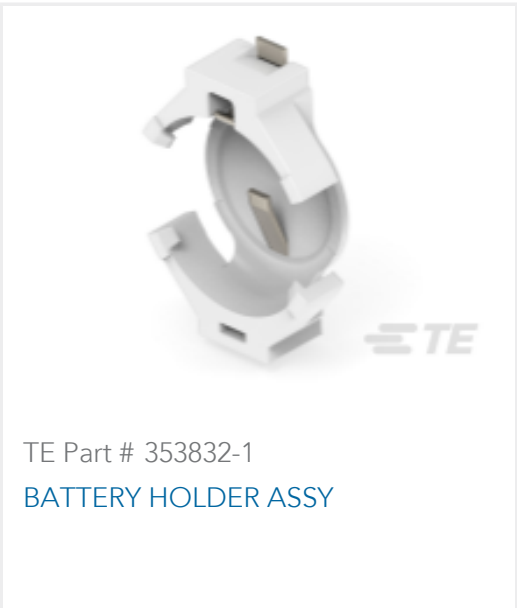
TE Part # 353832-1 BATTERY HOLDER ASSY