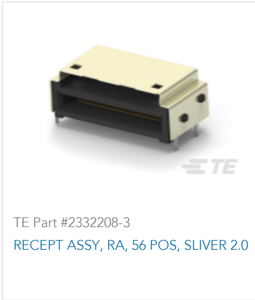
TE Part #2332208-3 RECEPT ASSY, RA, 56 POS, SLIVER 2.0