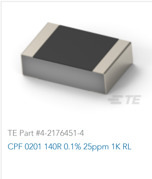
TE Part #4-2176451-4 CPF 0201 140R 0.1% 25ppm 1K RL