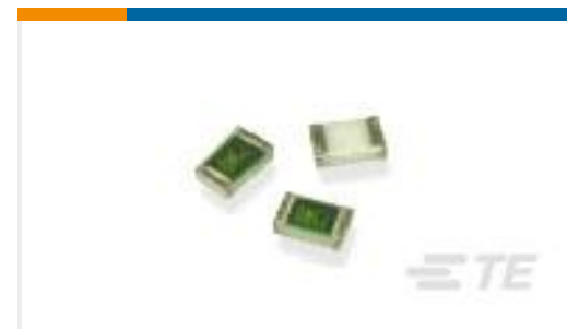
TE Part #5-2176093-0 RP 2A 0.25W 31K6 0.1% 25PPM 1K RL