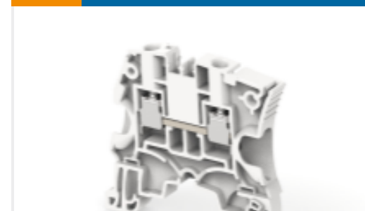
TE Part #1SNK506065R0000 ZS6-WH