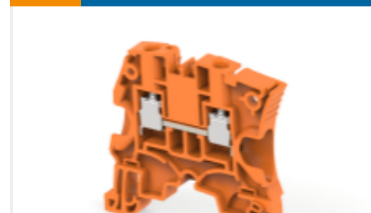
TE Part #1SNK506030R0000 ZS6-OR