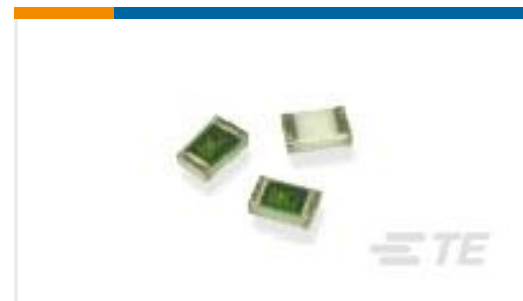
TE Part #1-2176093-5 RP 2A 0.25W 13K3 0.1% 25PPM 1K RL