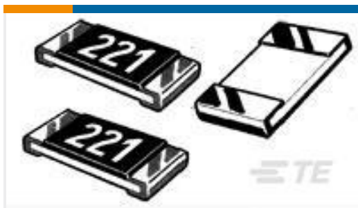
TE Part #4-2176070-0 3521 430R 1% 2W