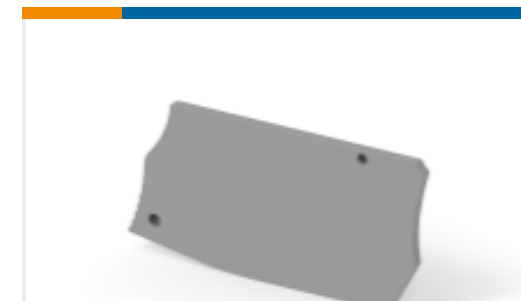
TE Part #1SNK505910R0000 ES4