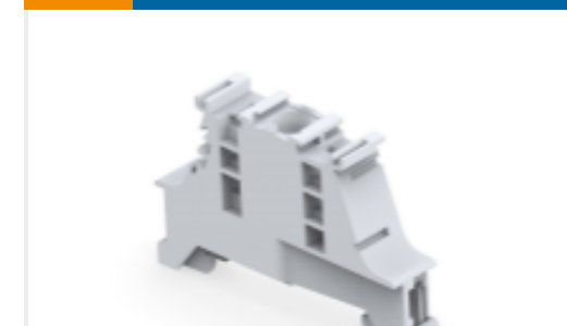
TE Part #1SNK900001R0000 BAM4