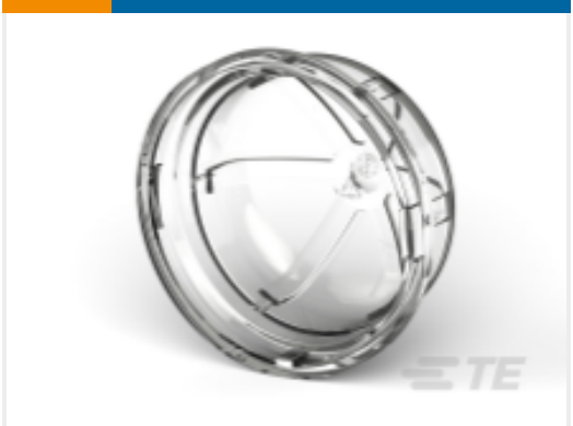
TE Part #1-2329013-1 LUMAWISE 40MM DIA DOME CLEAR LOW