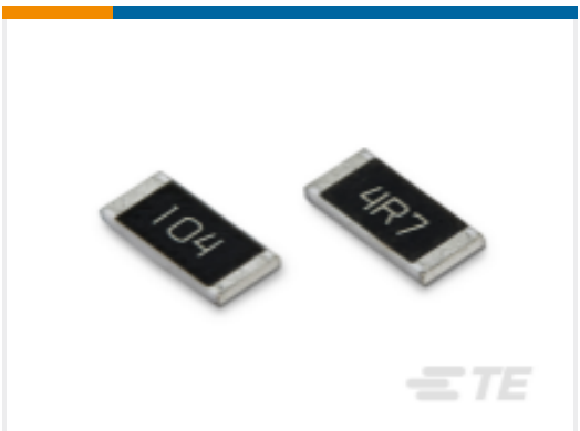
TE Part #5-2176455-9 CPF 0402 442K 0.1% 25ppm 1K RL