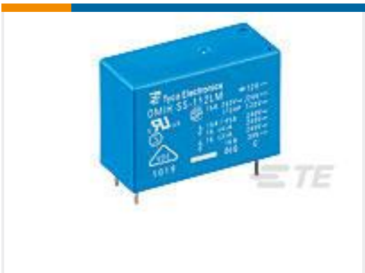
TE Part #2-1419153-2 OMIH-SS-124LM,300