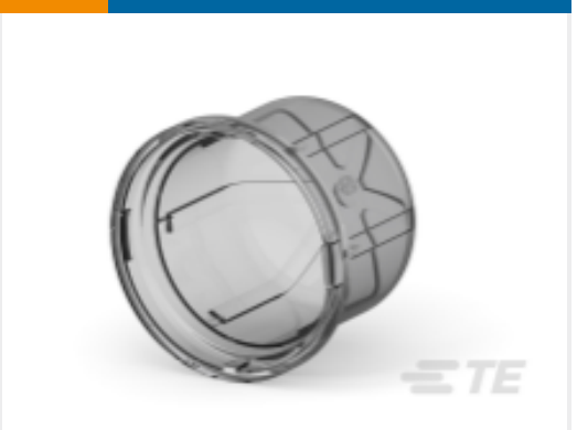
TE Part #2329013-2 LUMAWISE 40MM DIA DOME SMOKE GRAY TALL