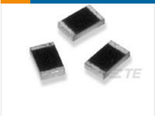
TE Part #7-1879254-0 RP 2B 40R2 0.1% 15PPM CUT LENGTH