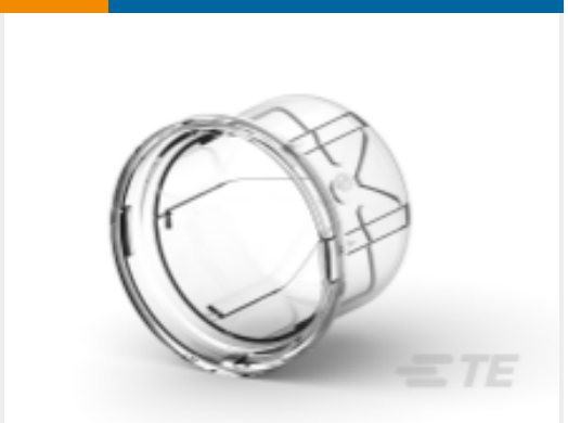
TE Part #1-2329013-2 LUMAWISE 40MM DIA DOME CLEAR TALL